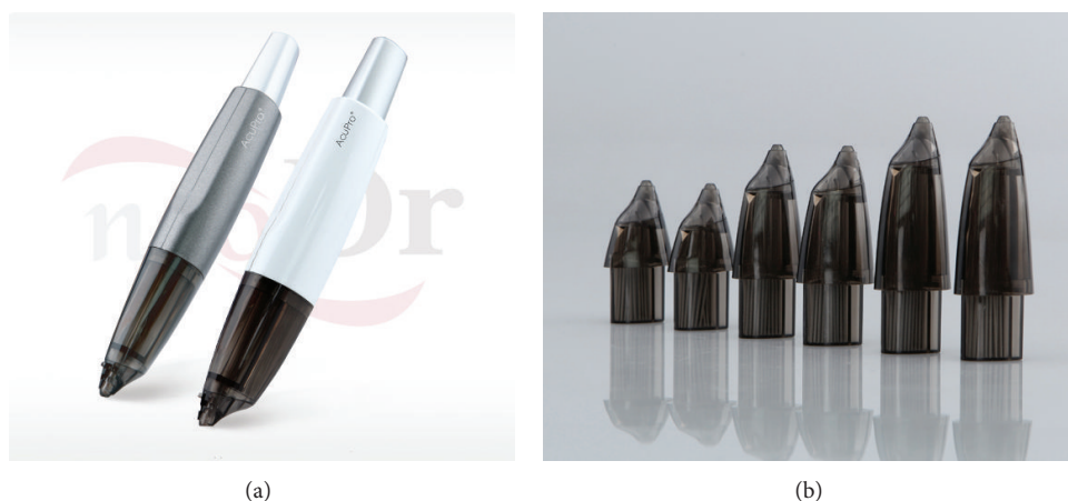
FIGURE 2: AcuPro and stainless steel fine needles used in this study.