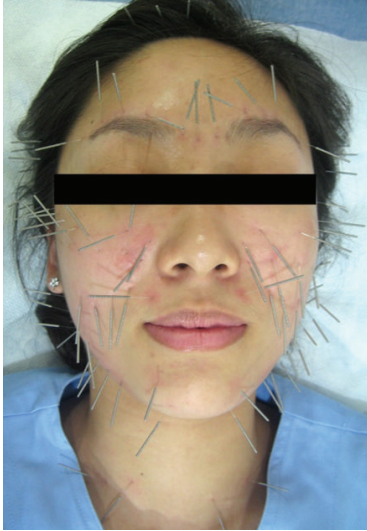
FIGURE 1: Facial cosmetic acupuncture applied in this study.

Clinical Practice guidelines and the revised version of the Declaration of Helsinki. The trial protocol was approved by the Institutional Review Board of Kyung Hee University Hospital at Gangdong (KHNMU-OH-IRB 2011-007). Written informed consent was obtained from all participants prior to enrollment, and participants were given ample time to decide about participating before signing the consent form.